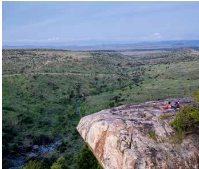
Pride Rock at Borana Conservancy