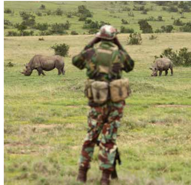
Borana 2018-395

Borana Conservancy, as part of the wider Lewa-Borana Landscape, is home to over 200 black and white rhinos. Guests staying in the conservancy can join a team of trained scouts and rangers as they track both black and white rhinos on foot at first light everyday. Guests are given the opportunity to get a true 'behind-the-scene' insight into how the conservancy is run as well as spending valuable time getting to know the men and women who keep these endangered species safe. This is a truly authentic experience offered to all guests staying at a property on Borana Conservancy.