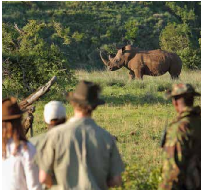
Borana 2018-108.1